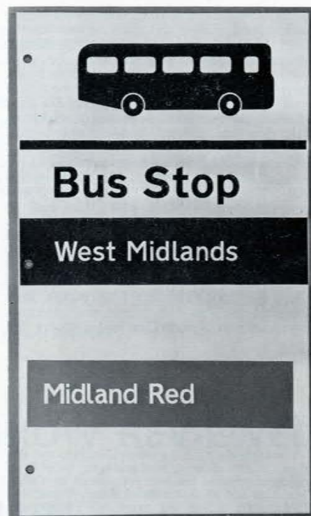
The bus stop sign produced for stops common to both undertakings

The following services operating west and north of Wolverhampton were transferred from WMPTE to Midland Red. They were given new Midland Red service numbers as shown in brackets:—